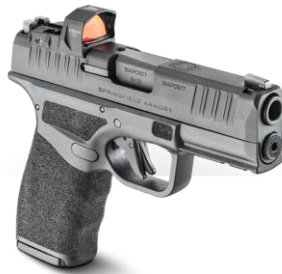
SIG SAUER MACRO

DRAWING TO BE HELD ON December 20, 2024 @ 1900